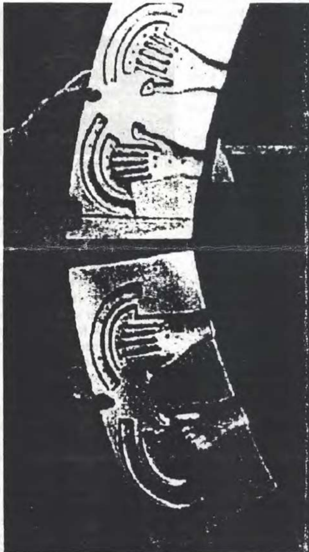
CONTROL PANELS ALLEGEDLY FROM 1947 CRASH IN ROSWELL OR SOCORRO, NM WITH PLACES FOR ALIENS' HANDS

abduction experience. All of the people working together, sharing the information they have, "laying the pieces of the puzzle" out on the table, will lead to us eventually getting to the truth, she said. As they say on The X Files, the truth is out there!